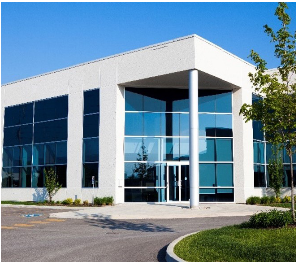
View of an employment center