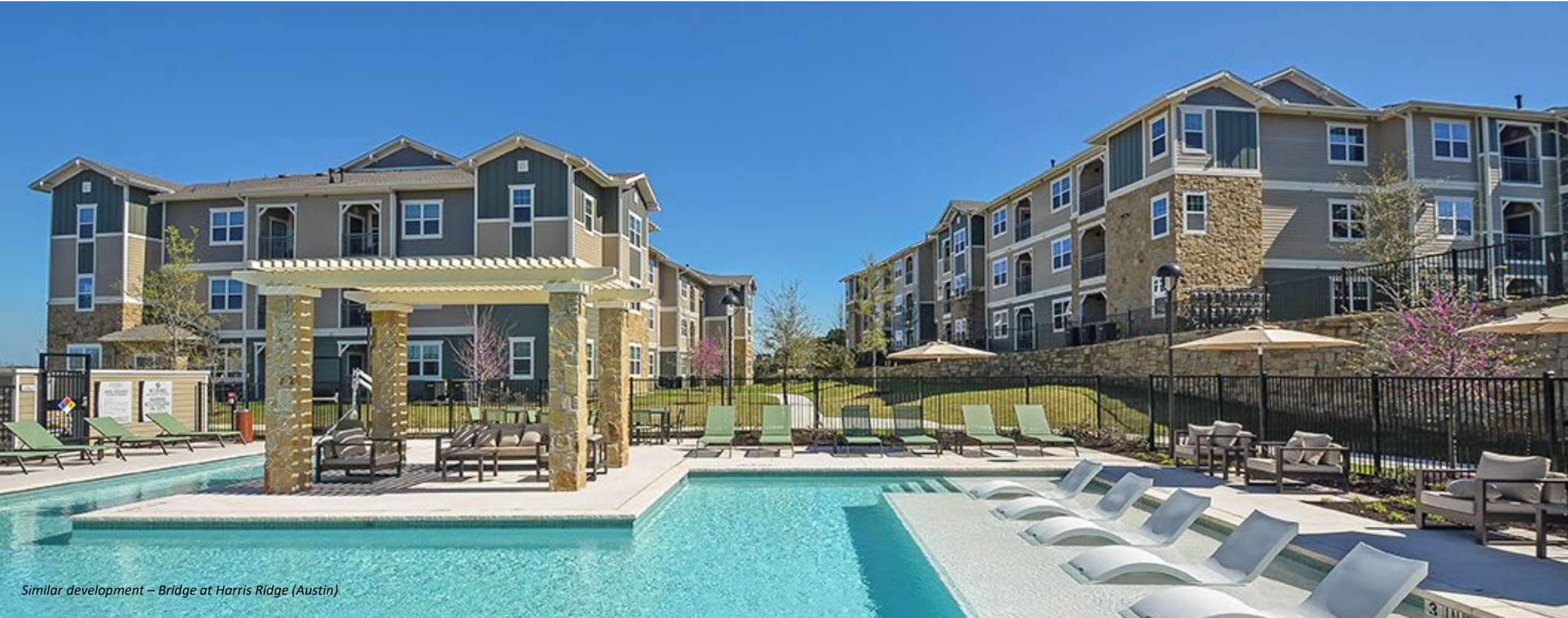
Similar development – Bridge at Harris Ridge (Austin)

CR 138 & Windmill Ranch Pflugerville, Texas