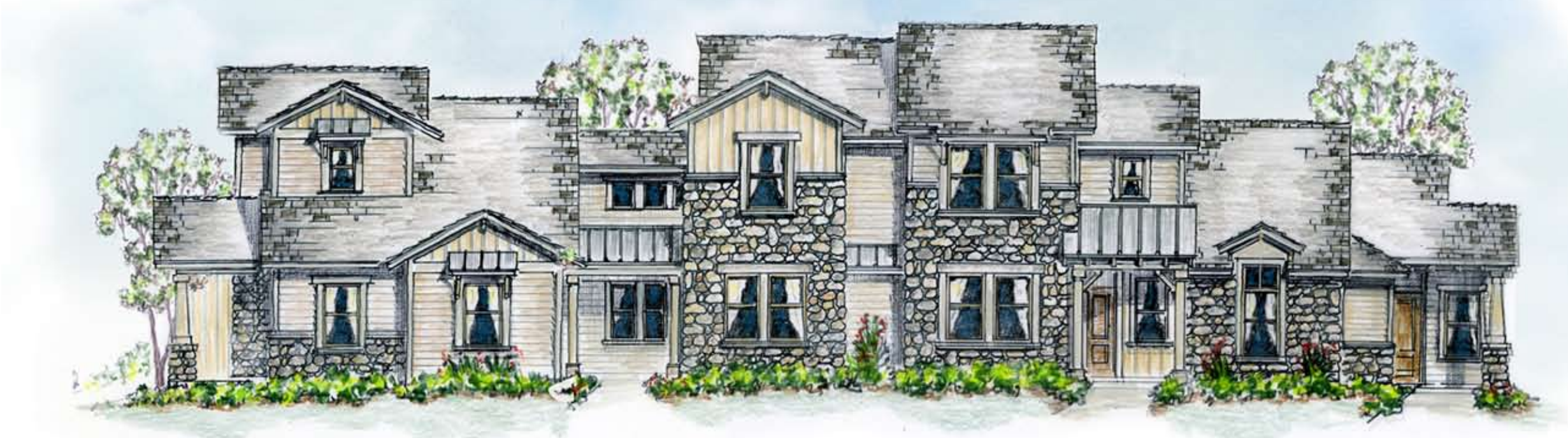
TH-D 36% Front 25% TH-C 47% Front: 51% TH-B 20% Front: 61% TH-A 63% Front: 85%