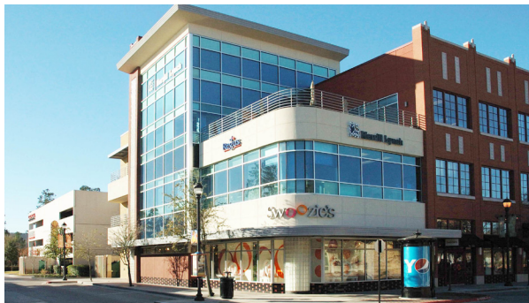
Mixed-use office and retail

Residential Uses - Low-rise single-family, retirement, and middle housing types are desired for compatibility with existing adjacent neighborhoods. New housing should be thoughtfully integrated into neighborhood corner development and, where feasible, safe, and convenient connections from existing neighborhoods should be provided. In many cases, the layout of existing neighborhoods may preclude direct walking connections to neighborhood corners.