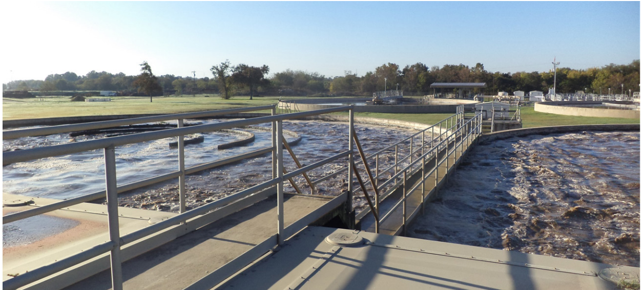
Wastewater Treatment Plant

The Utilities land use category includes areas where public utilities and associated structures are necessary. Existing facilities support development and are crucial to the future growth of the City. Utilities should be located away from residential uses, when possible. Transitional land uses or screening should be provided between utilities and residential land uses.