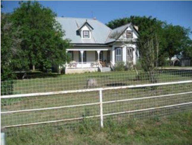
WEST OF SITE