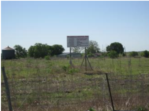
SOUTH OF SITE