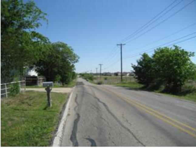
NORTH OF SITE