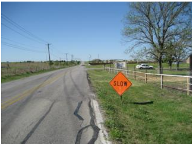
SOUTH OF SITE