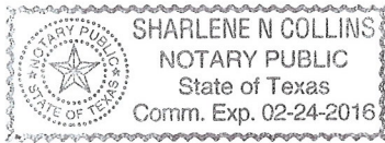
Notary Public Signature