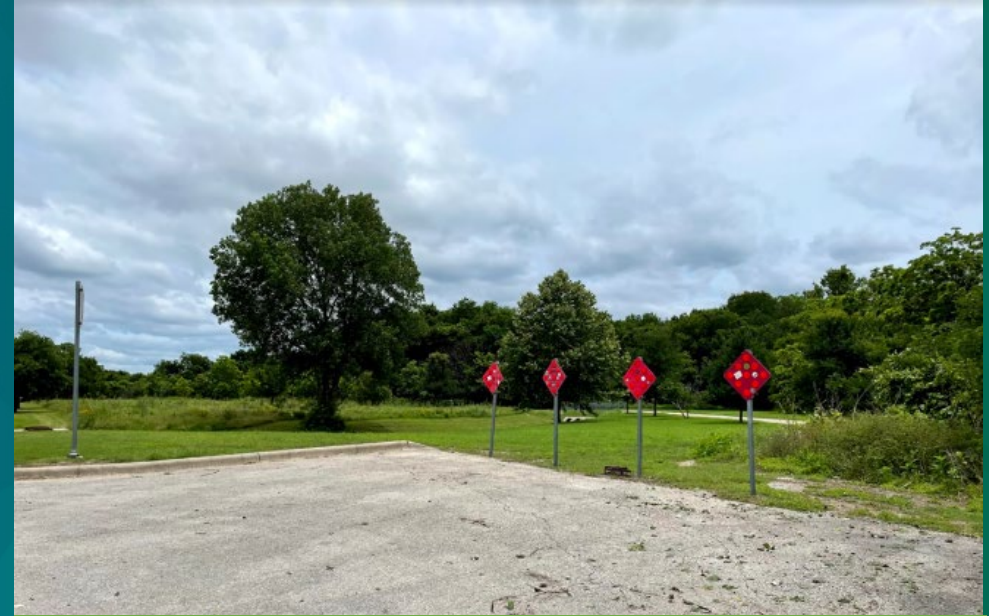
6/1/2021 Project Team Site Visit – Off street area near Pecan Park used as parking