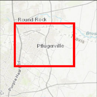
VICINITY MAP 1 INCH = 10 MILES

Project Description: Approximately 14,000 LF of 10" reclaimed waterline to serve the Lake Pflugerville Park, Verona Park, and large volume commercial customers reclaimed water. Project Driver: This project will help convert some existing large volume potable water users to reclaimed water and reduce the City's overall potable water usage. The project will also convert the Lake Pflugerville Park and Verona Park from using potable water for irrigation to reclaimed water.