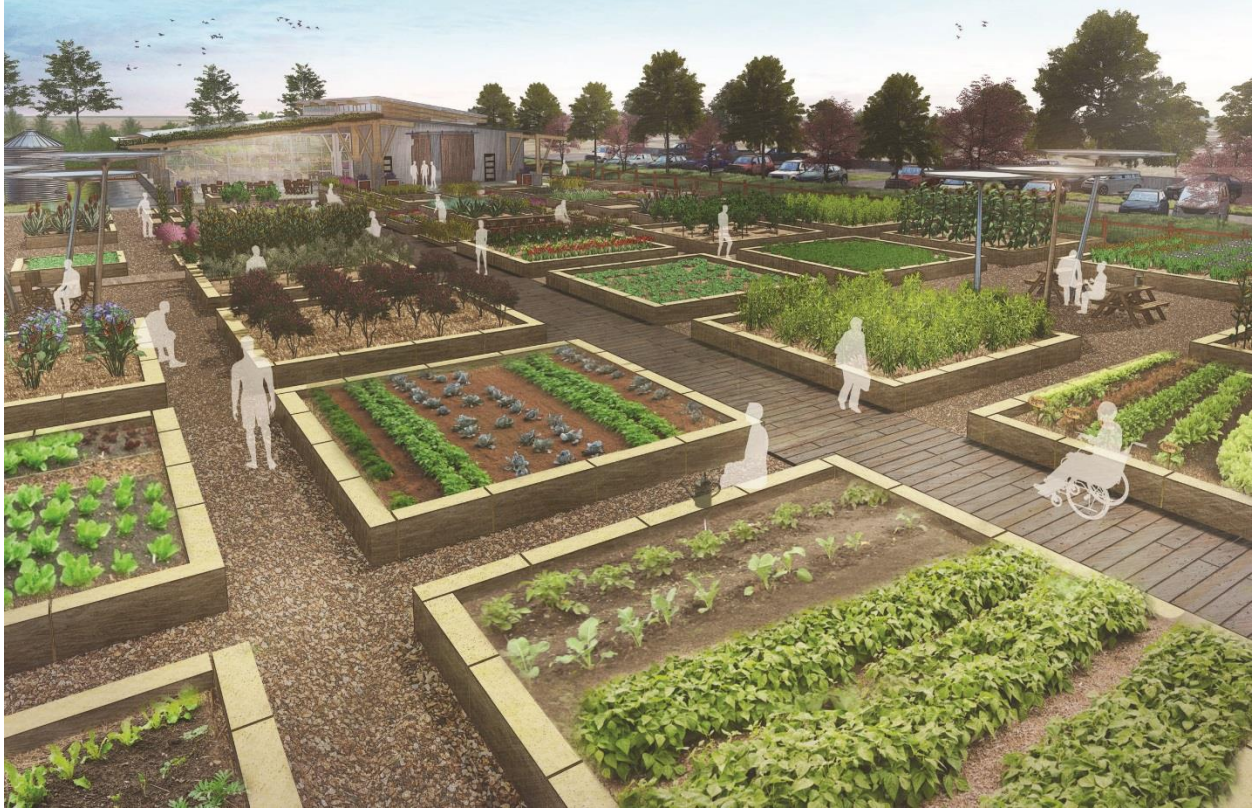
Proposed rendering of garden area