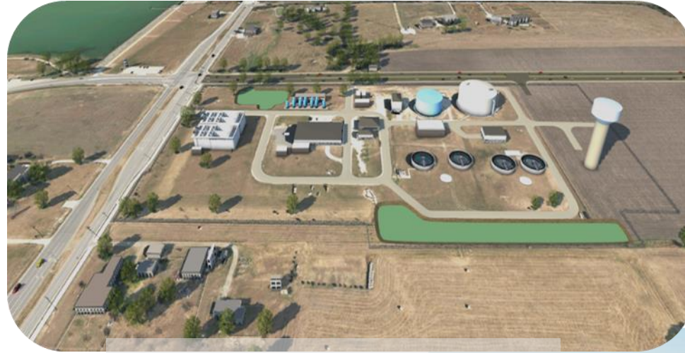
Surface Water Treatment Plant