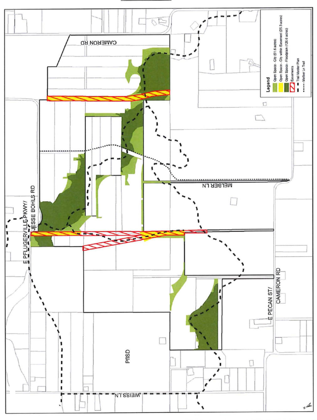
Exhibit K – City Land Plan Per Section 2.3