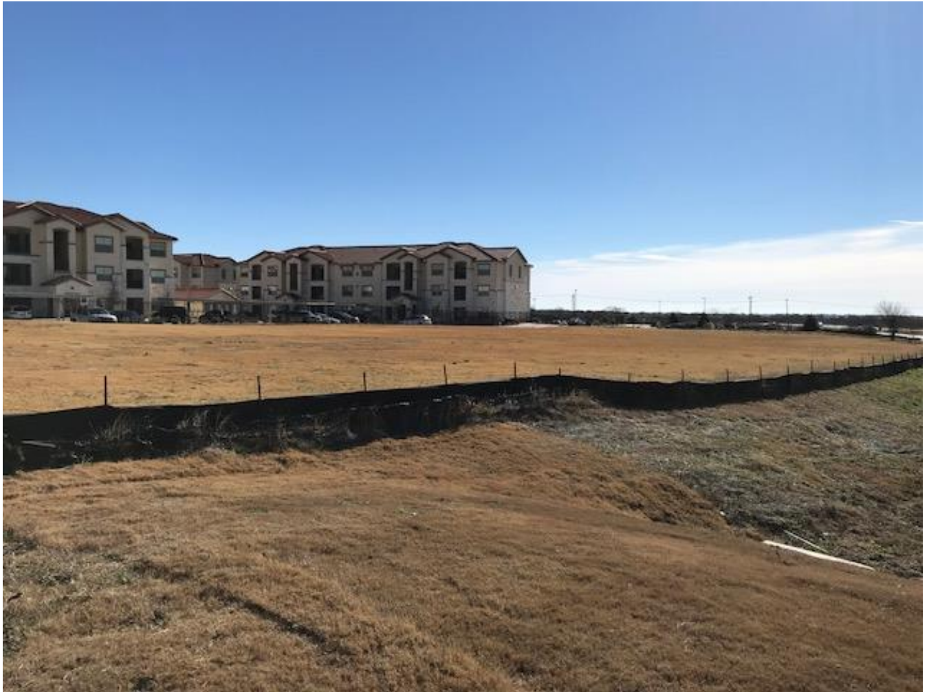
Lot 2B Block A proposed 2.00-acre proposed commercial tract.