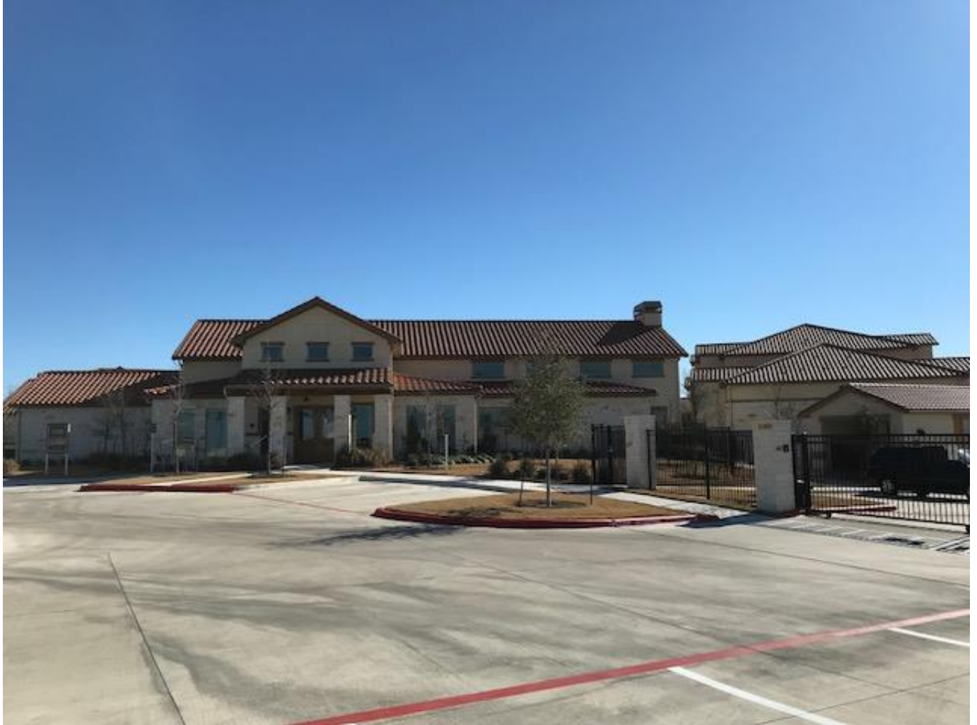
Lot 2A Block A the Highlands Luxury Apartments.