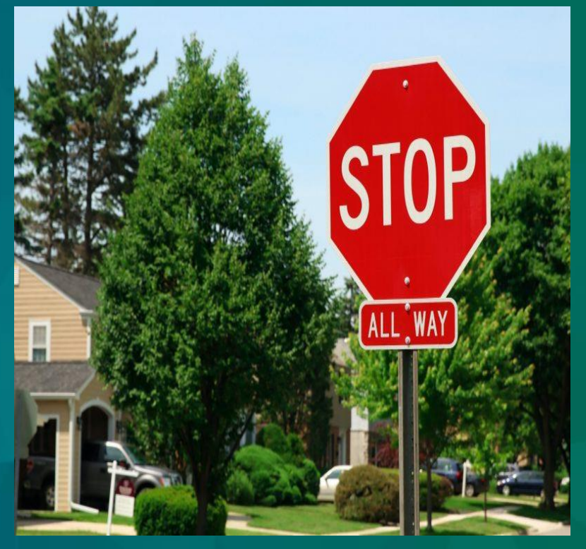
Total of 91 new Stop-Signs