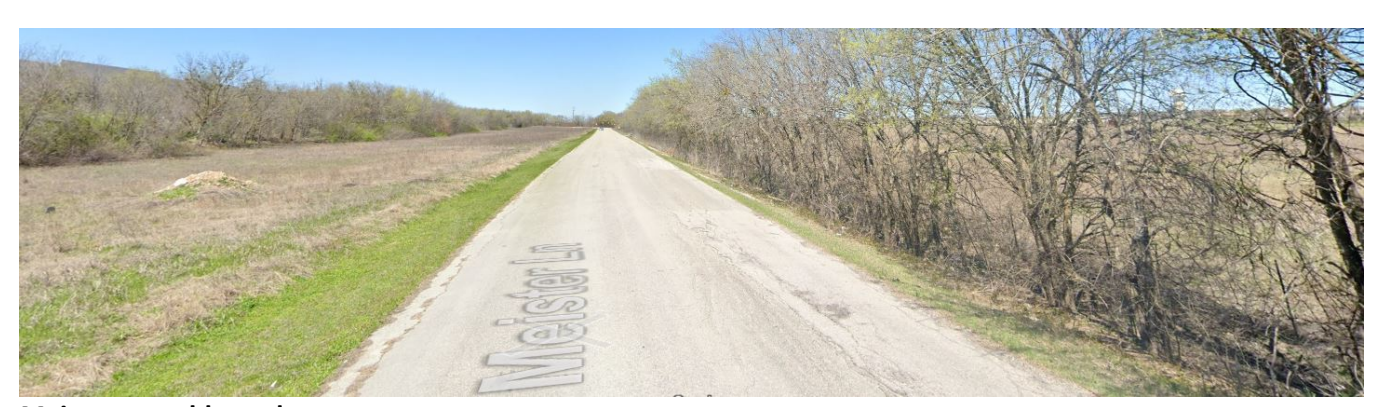
Meister - northbound